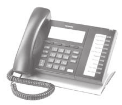
4-line Backlit LCD 10 programmable buttons (available with or without local CO line interface)

IP5122-SD or IP5122-SDC IP5022-SD (non backlit) LCD