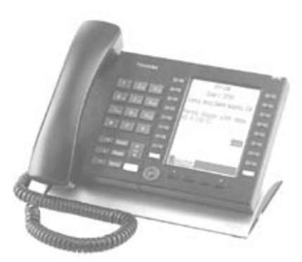
9-line Backlit LCD 20 programmable buttons and LCD key labels and integrated browser

Whether you are outfitting your executive offices, upgrading your call center, enhancing communications at a branch or virtual office, or gearing up a receptionist station, Toshiba's IP5000 series has solutions for any need across your enterprise. Convenient add-on modules let you enhance functionality for even greater flexibility.