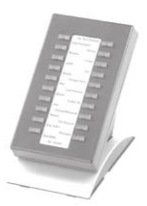
Add-On Module 20 programmable buttons KM5020

IP5122-SD or IP5122-SDC IP5022-SD (non backlit) LCD